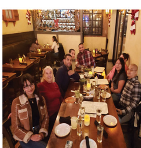
We thank the owners & staff of the restaurant for taking great care of us. Yes, the food was very good.

I was alone under the full moon until I saw my shadow. Then we danced with the snowflakes and were all happy. Enjoy the simple delights. They cost nothing and are found in the winter.