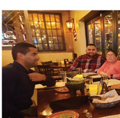
The PWFCU staff wrapped up 2024, with a fun holiday party at Mesita in Port Washington.

Call or visit before other pressing issues arise.